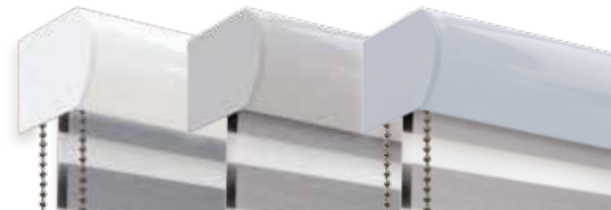
TW68R 74 x 70